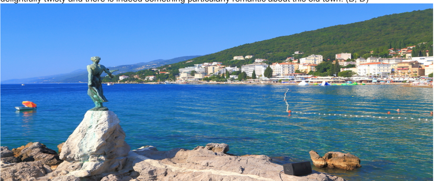
Day 7 - OPATIJA

After breakfast we begin our tour with a visit to the Roman Amphitheatre in Pula. While this Amphitheatre is one of many left around Europe by Roman engineers it is certainly one of the best preserved anywhere. We'll also spend some time in the old town before heading to Rovinj. Rovinj rises dramatically from the Adriatic. Its streets are delightfully twisty and there is indeed something particularly romantic about this old town. (B, D)